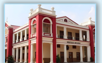
St. Joseph's Academy, Dehradun (1934)