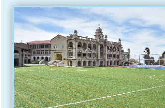
St. George's College, Mussoorie (1853)