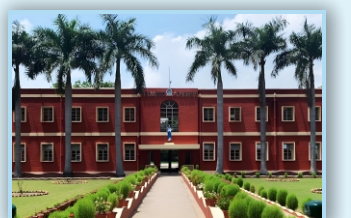
St. Mary's Academy, Meerut (1952)